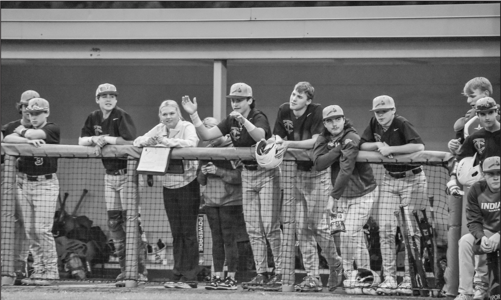
The Towns County dugout cheers on their teammates during a road game earlier this season.